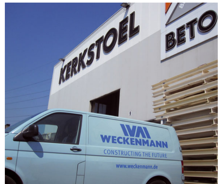
All modernisations are carried out during normal business operation thanks to the good co-ordination

Commissioning of a new CAD-CAM-controlled pallet circulation system for the production of double walls.