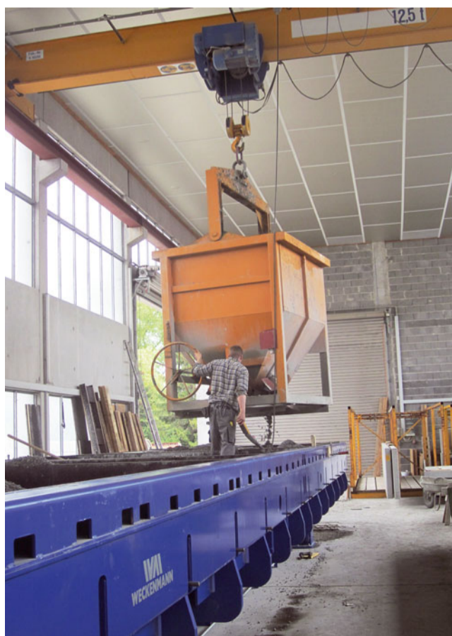
The flexible siderail of the tilting table in use at the company Fensterle

The installation and commissioning was carried out immediately on the following weekend, so that the system could be tested for acceptance and the documentation could be handed over already on the following Monday.