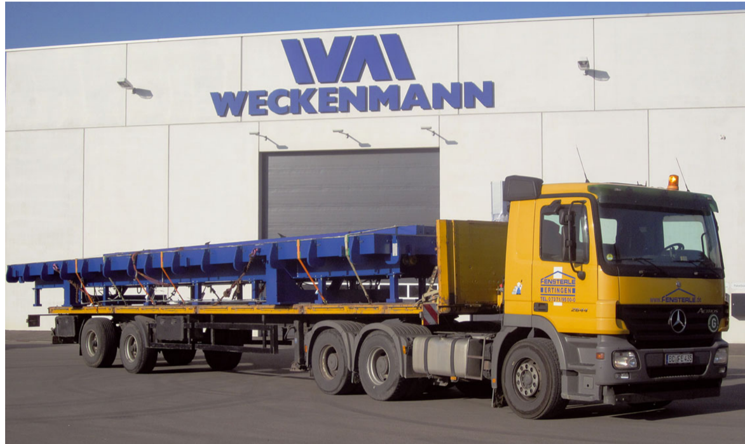
Pick up of the tilting table at the Weckenmann plant in Dormettingen